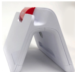
Osmo Fire Tablet Base